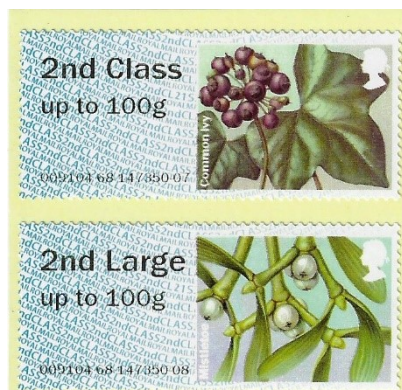
2021 Christmas 2 nd Class Post and Go (from Basildon PO)