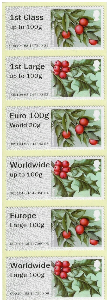
2020 Christmas 1 st Class Post and Go with 2021 rates (from Basildon PO)

Christmas Post and Go stamps are giving their usual opportunities to collect less-common items.