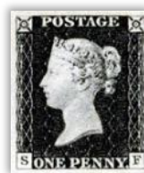
The world's first postage stamp, the Penny Black.