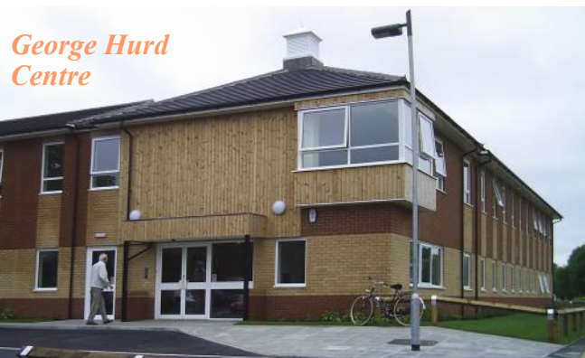
George Hurd Centre

If you are still not sure whether the Basildon Philatelic Society is for you, then you are cordially invited to attend a meeting as our guest.