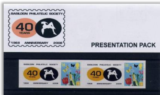
The Society marked its 40th year by issuing a presentation pack in 2008.

There is a charge of £1.00 per meeting which includes free refreshments.